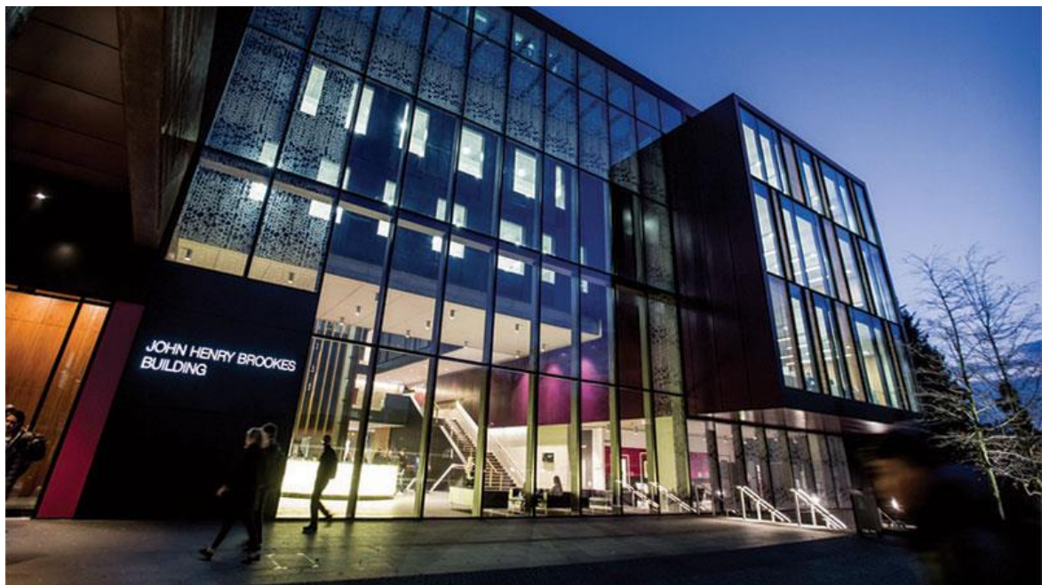
Image – Oxford Brookes University, Headington campus, Oxford, UK.